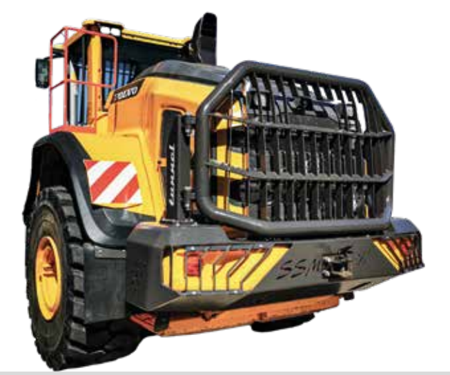
Heavy-duty ram protection

In addition, SSM provides retrofitted machines – customized and specific to the application – and special solutions for construction machinery from other brands as well. Special applications require specific equipment. For this purpose, we also develop individual solutions and build customized machines and system components, e.g. for tunnel construction and mining, the forestry sector, as well as ramming machines, shaft sinking equipment, etc.